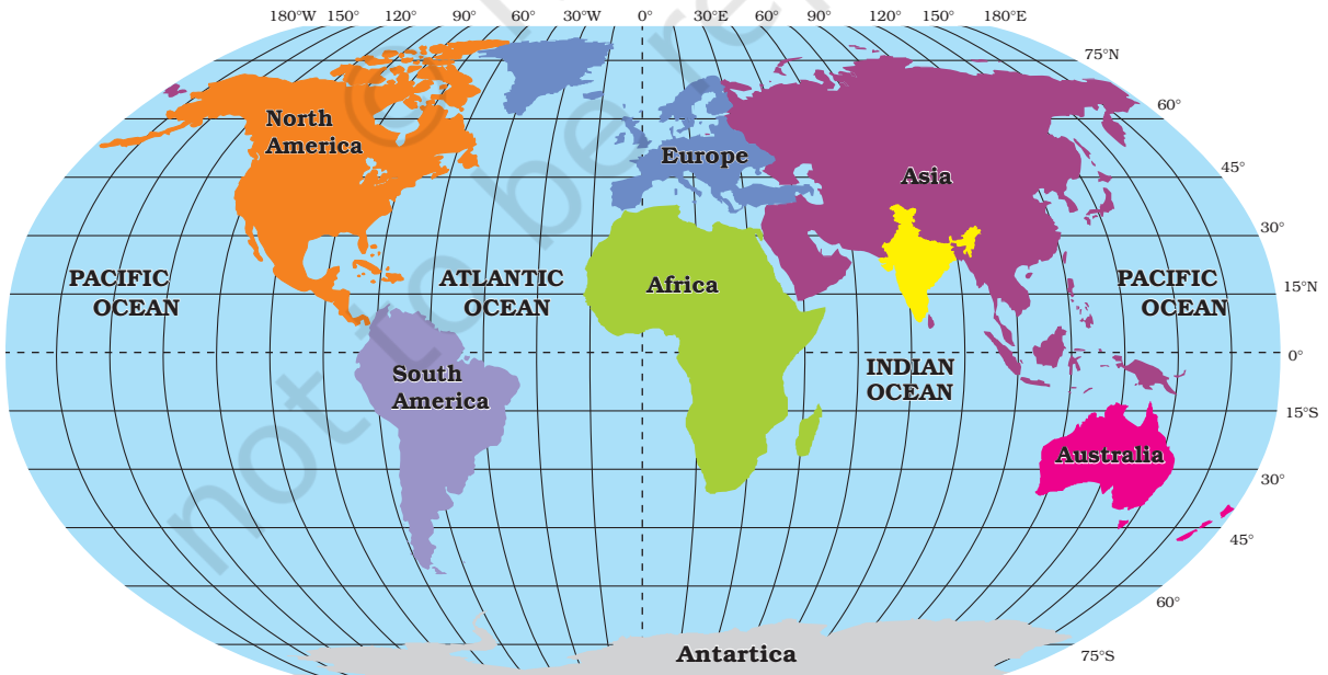
Figure 1.1 : India in the World

The land mass of India has an area of 3.28 million square km. India's total area accounts for about 2.4 per cent of the total geographical