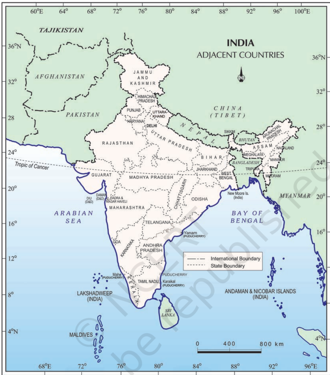
Figure 1.5 : India and Adjacent Countries

Sri Lanka and Maldives. Sri Lanka is separated from India by a narrow channel of sea formed by the Palk Strait and the Gulf of Mannar, while Maldives Islands are situated to the south of the Lakshadweep Islands.