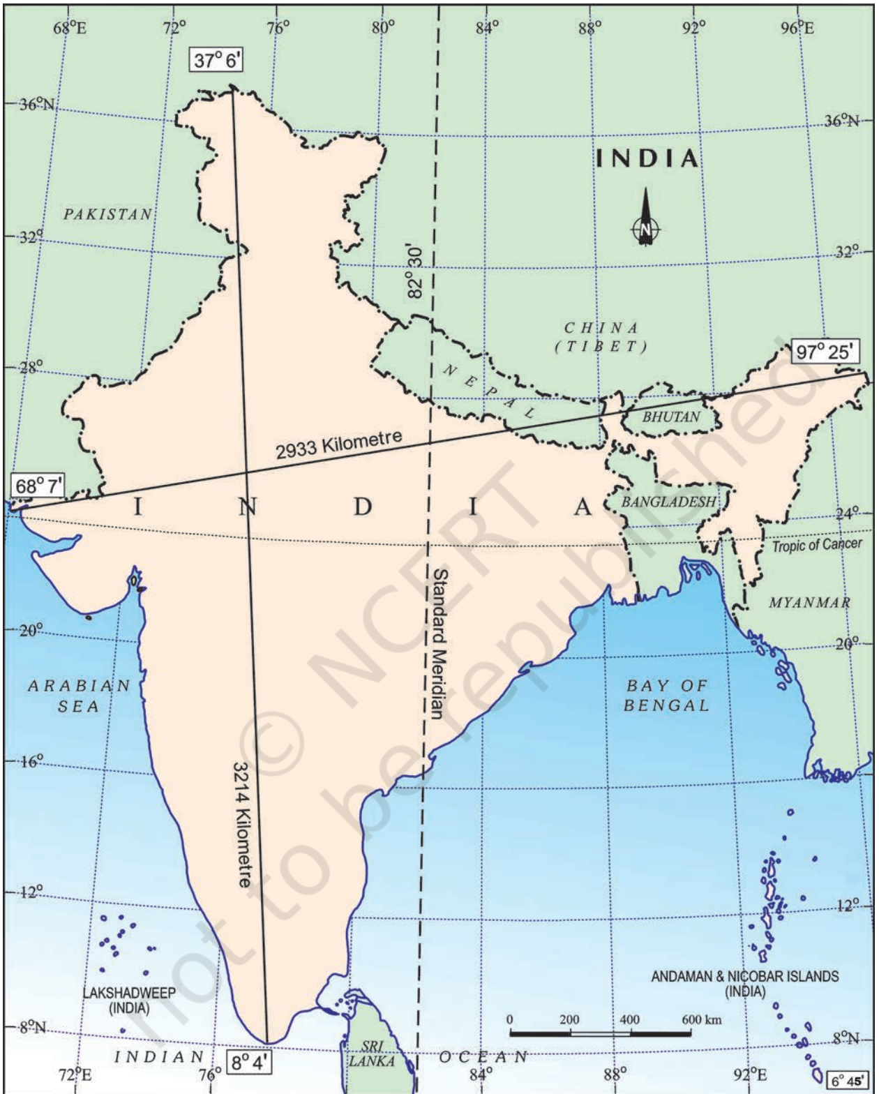
Figure 1.3 : India : Extent and Standard Meridian