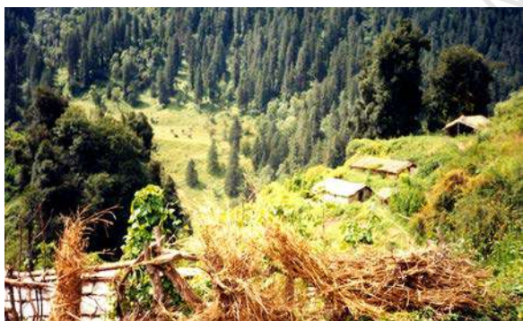
Figure 16.2 A view of a forest life

Do you think such use of forest resources would lead to the exhaustion of these resources? Do not forget that before the British came and took over most of our forest areas, people had been living in these forests for centuries. They had developed practices to ensure that the resources were used in a sustainable manner. After the British took control of the forests (which they exploited ruthlessly for their own purposes), these people were forced to depend on much smaller areas and forest resources started becoming over-exploited to some extent. The Forest Department in independent India took over from the British but local knowledge and local needs continued to be ignored in the management practices. Thus vast tracts of forests have been converted to monocultures of pine, teak or eucalyptus. In order to plant these trees, huge areas are first cleared of all vegetation. This destroys a large amount of biodiversity in the area. Not only this, the varied needs of the local people – leaves for fodder, herbs for medicines, fruits and nuts for food – can no longer be met from such forests. Such plantations are useful for the industries to access specific products and are an important source of revenue for the Forest Department.