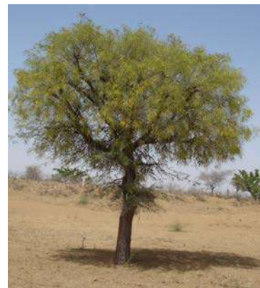
Figure 16.3 Khejri Tree

We need to accept that human intervention has been very much a part of the forest landscape. What has to be managed in the nature and what may be the extent of this intervention? Forest resources ought to be used in a manner that is both environmentally and developmentally sound – in other words, while the environment is preserved, the benefits of the controlled exploitation go to the local people, a process in which decentralised economic growth and ecological conservation go hand in hand. The kind of economic and social development we want will ultimately determine whether the environment will be conserved or further destroyed. The environment must not be regarded as a pristine collection of plants and animals. It is a vast and complex entity that offers a range of natural resources for our use. We need to use these resources with due caution for our economic and social growth, and to meet our material aspirations.