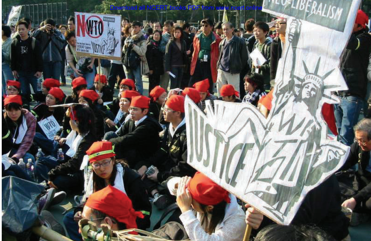
A demonstration against WTO in Hong Kong, 2005