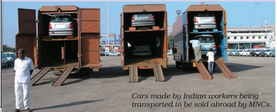
Cars made by Indian workers being transported to be sold abroad by MNCs.