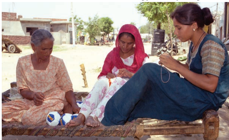
Women at home in Ludhiana making footballs for large MNCs

Thus, we see that there are a variety of ways in which the MNCs are spreading their production and interacting with local producers in various countries across the globe. By setting up partnerships with local companies, by using the local companies for supplies, by closely competing with the local companies or buying them up, MNCs are exerting a strong influence on production at these distant locations. As a result, production in these widely dispersed locations is getting interlinked.