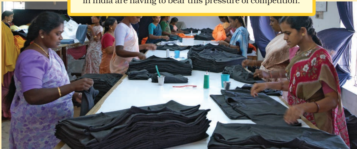
Factory workers folding garments for export. Though globalisation has created opportunities for paid work for women, the condition of employment shows that women are denied their fair share of benefits.

Let us see how the workers in the garment export industry in India are having to bear this pressure of competition.