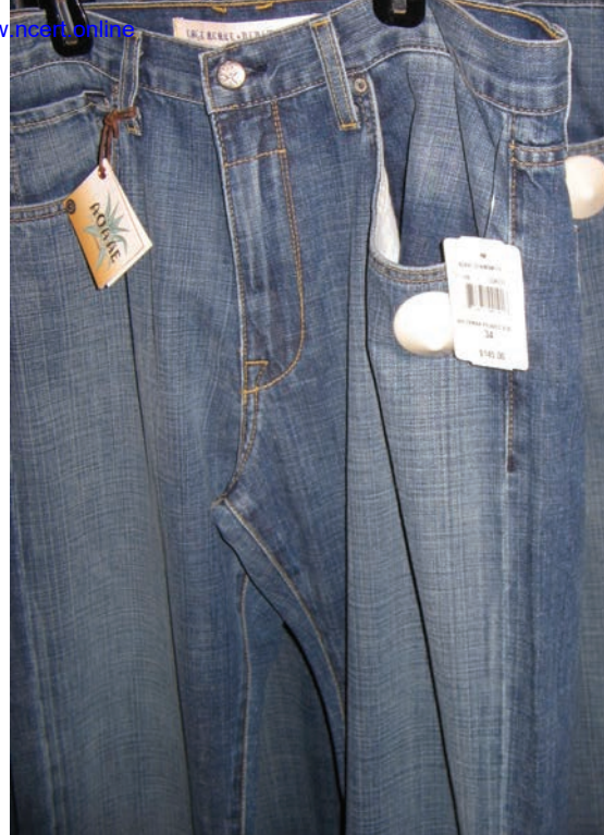
Jeans produced in developing countries being sold in USA for Rs 6500 ($145)

There's another way in which MNCs control production. Large MNCs in developed countries place orders for production with small producers. Garments, footwear, sports items are examples of industries where production is carried out by a large number of small producers around the world.