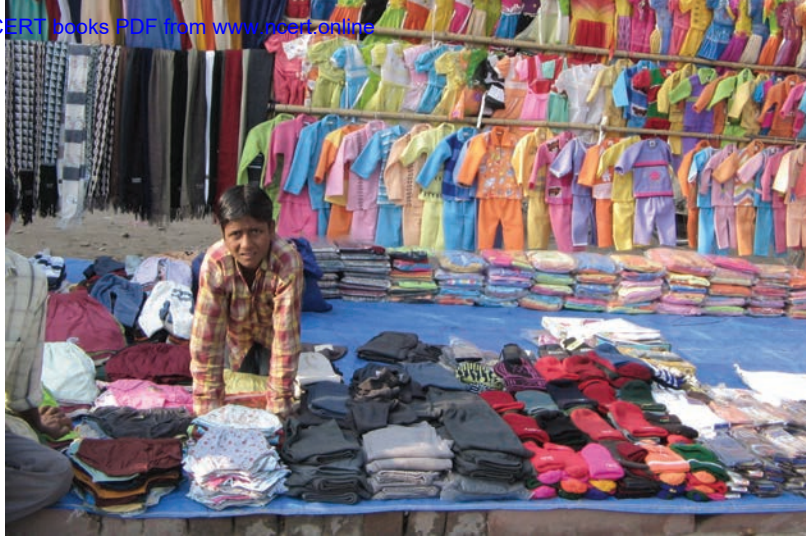
Small traders of readymade garments facing stiff competition from both the MNC brands and imports.

In general, with the opening of trade, goods travel from one market to another. Choice of goods in the markets rises. Prices of similar goods in the two markets tend to become equal. And, producers in the two countries now closely compete against each other even though they are separated by thousands of miles! Foreign trade thus results in connecting the markets or integration of markets in different countries.