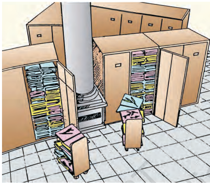
Figure 1.2 Herbarium showing stored specimens

according to a universally accepted system of classification. These specimens, along with their descriptions on herbarium sheets, become a store house or repository for future use (Figure 1.2). The herbarium sheets also carry a label providing information about date and place of collection, English, local and botanical names, family, collector's name, etc. Herbaria also serve as quick referral systems in taxonomical studies.