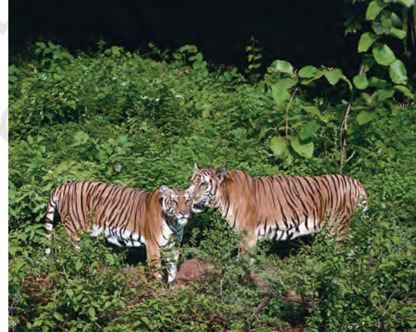
Figure 1.3 Pictures showing animals in different zoological parks of India